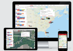
Portals & Apps

While CloudHawk endeavors to maintain the highest level of precision in all published specifications, it's essential to recognize that actual field performance may vary due to a myriad of factors, including environmental conditions, installation methods, usage scenarios, and the involvement of third-party entities such as cellular providers. The specifications provided are estimations and should not be construed as definitive commitments or alterations to the terms and conditions of your purchase or lease, including but not limited to, product operational constraints and warranties. All specifications remain subject to possible adjustments without prior notification. To ensure you are in possession of the most up-to-date specifications, please visit our website at www.cloudhawk.com .